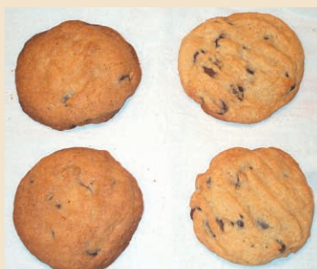
Above: The sugar snap-type cookie prepared from non-fat dry milk, pea proteins, and eggs. Cookies shown in duplicate. From left to right: non-fat dry milk, pea protein concentrate, freeze-dried pea isolate, spray-dried pea isolate, and eggs.