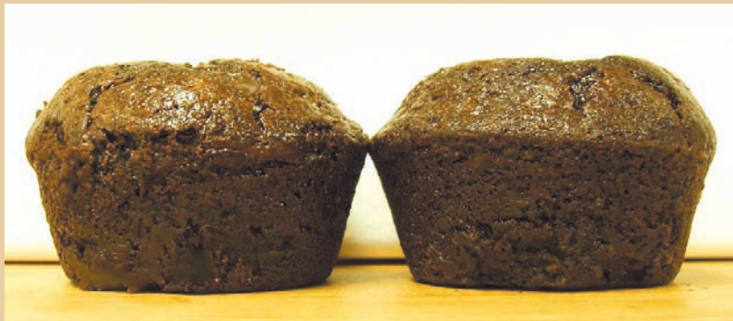
Chocolate cupcake on left had 100% of eggs replaced with pea protein. Cupcake on right contained eggs and no pea protein.

While pea isolates offer a more neutral flavor profile, pea protein concentrates are well-suited to products that already contain a flavoring agent. For example, recipes with normal amounts of vanilla, almond, chocolate, banana and sour cream are sufficient to maintain a neutral flavor transfer when using the less-refined concentrates as an egg replacement. When formulas are optimized to mimic egg-containing controls, baked goods made with pea protein concentrate have excellent texture; similar color and flavor, and comparable, but slightly softer structure. High-quality results were obtained without the addition of any emulsifiers or crumb enhancers.