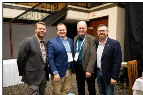
Attendees were able to hear an update from all CEO's of our national associations!