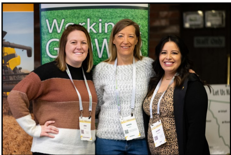
Part of the NPGA, PNWCA, and MGGA planning committee - happy to meet in person rather than zoom!