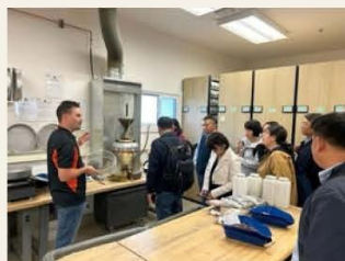
Touring Strick's Ag processing plant, in Chester Montana