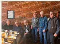
Visiting the State Grain Lab with a Trade Team from China, hosted by the USADPLC